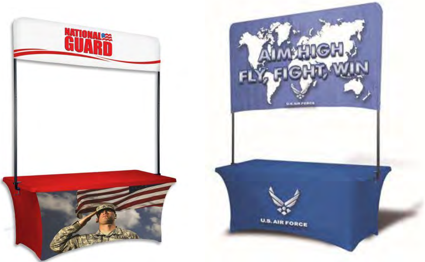
Table Top Billboard Banner & Stretch Table Cover Kit (Pricing below includes banner & tablecover – items can be ordered singularly)