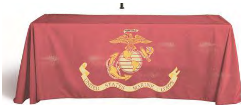
100% Polyester Dye Sublimated Table Covers (Three and Four sided to the floor coverage)

*Print as much or as little as you want.