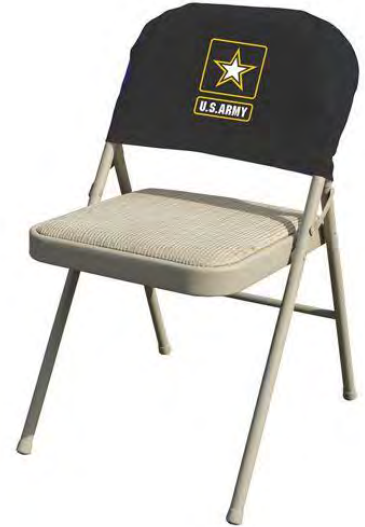
Style #713-3TP (Twill) # 713-1NP (NonWoven)